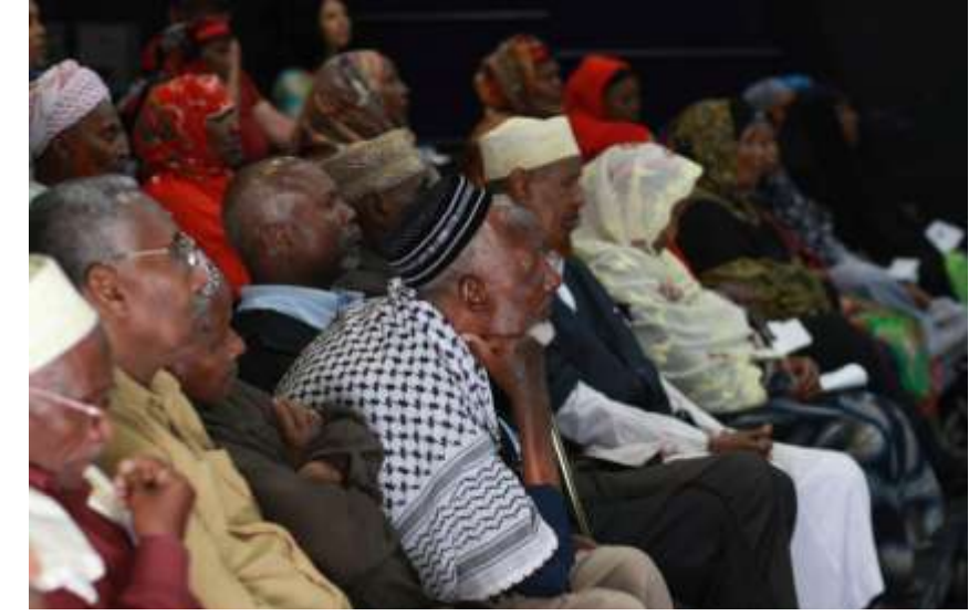
Community Members listening to a presentation