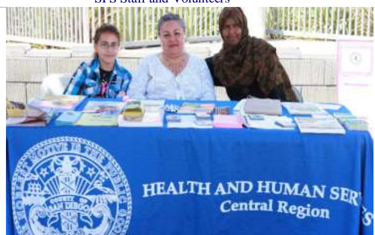
HHS Representatives from Central Region