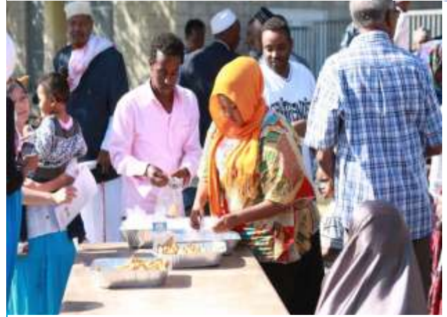
Participants enjoying Somali sambosas